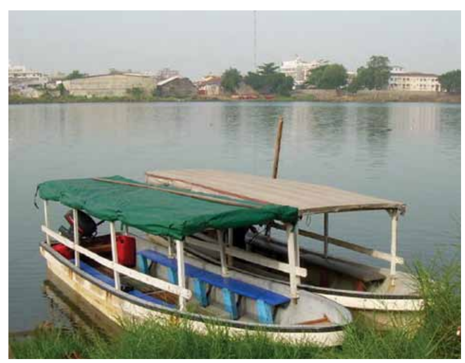
Figure 3. Fishing boats anchored in an estuary in Beninn.

Coastal urbanization is due primarily to the large industrial and tertiary sectors in Cotonou. The population of the main cities (Grand-Popo, Ouidah, Cotonou and Sèmè) is estimated at nearly 1,500,000 inhabitants. The urbanization of Cotonou is more alarming. The city, with approximately 750,000 inhabitants, is the only viable area for urbanization and has expanded rapidly, resulting in significant erosion.