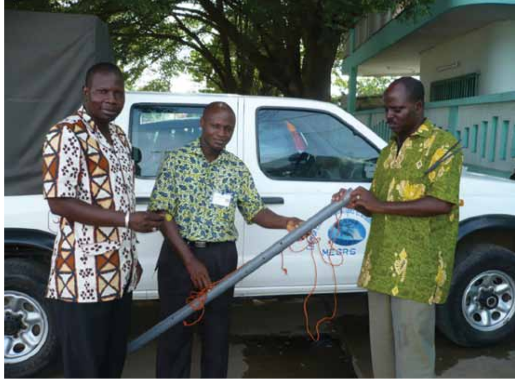
Figure 4. CRHOB researchers prepare oceanographic equipment for data collection.

More broadly, the main issues affecting coastal area of Benin are: